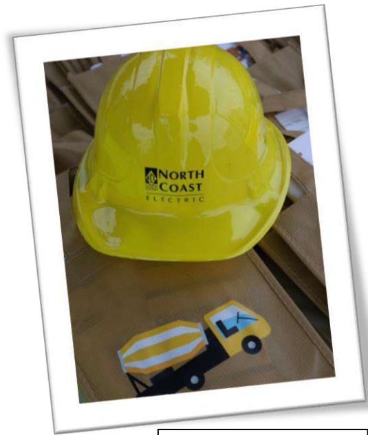
2018 Hard Hat Sponsor, North Coast Electric